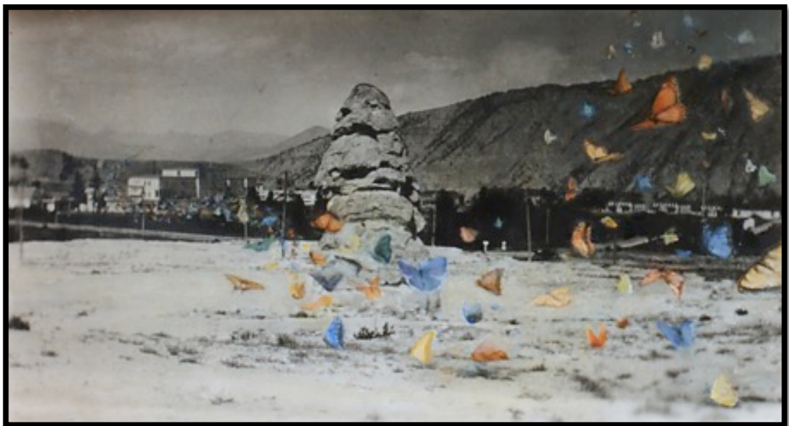
Here, Then, Today, and Far Away (details)