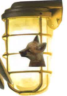
Illustration sheet for a Person